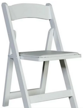
Americana (No additional charge)