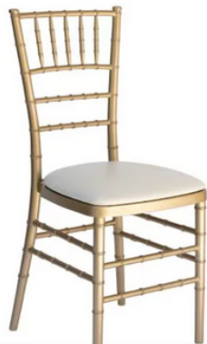
Gold Tiffany + $2 per chair