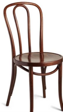
Bentwood + $5 per chair