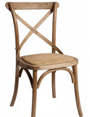
Timber Crossback + $5 per chair